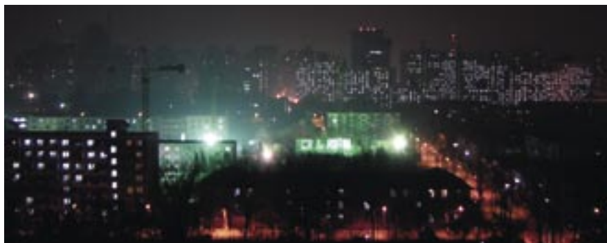
Home of the once "Forbidden City," Beijing (along with Shanghai and the rest of China) is open for biotech business.

China's rapidly expanding economy has made it the "world's manufacturer" for many labor-intensive products; however, biopharmaceuticals are in a different technical class. To secure a